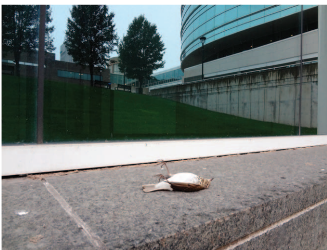
FIGURE 1. A Swainson’s Thrush killed by colliding with the window of a low-rise office building on the Cleveland State University campus in downtown Cleveland, Ohio.

We reviewed the published literature on bird–building collisions and also accessed numerous unpublished datasets from North American building-collision monitoring programs. We extracted >92,000 fatality records—by far the largest building collision dataset collected to date—and (1) systematically quantified total bird collision mortality along with uncertainty estimates by combining probability distributions of mortality rates with estimates of numbers of U.S. buildings and carcass-detection and scavenger-removal rates; (2) generated estimates of mortality for different classes of buildings (including residences 1–3 stories tall, low-rise non-residential buildings and residential buildings 4–11 stories tall, and high-rise buildings \geq 12 stories tall); (3) conducted sensitivity analyses to identify which model parameters contributed the greatest uncertainty to our estimates; and (4) quantified species-specific