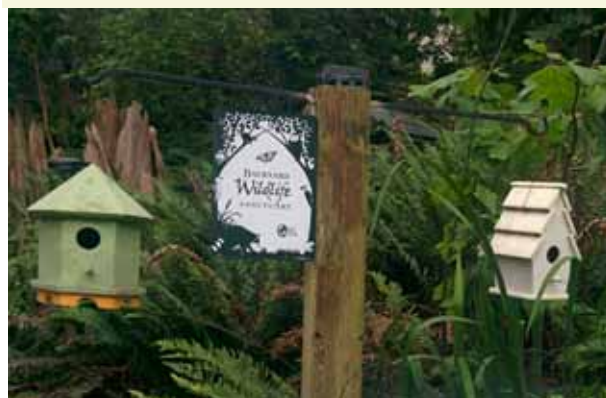
Backyard Wildlife Sanctuary certification sign near Howarth Park.

If you are committed to getting your yard certified, we have a limited number of native plants left to help you enhance your habitat, including salmonberries, thimbleberries, mountain ash, salal, and Oregon grape. These are available free of charge. Please contact me with any questions you have: habitat@pilchuckaudubon.org ; 360-421-8423. Hope to see you at the October program meeting! ✧