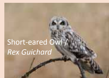
Short-eared Owl / Rex Guichard