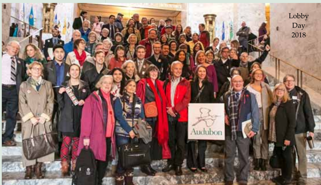
Lobby Day 2018

Democrats will be the 116th congressional majority in the U. S. House in January. Some races are being recounted; litigation is a possibility. Could be some races will be rerun based on respective state laws about elections. U. S.