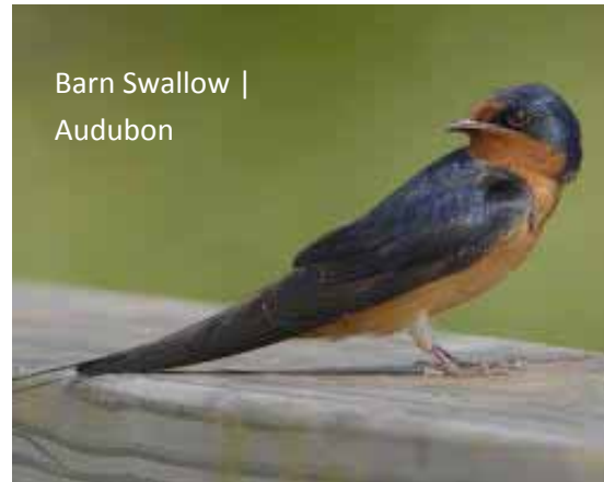
Barn Swallow | Audubon