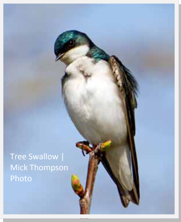
Tree Swallow