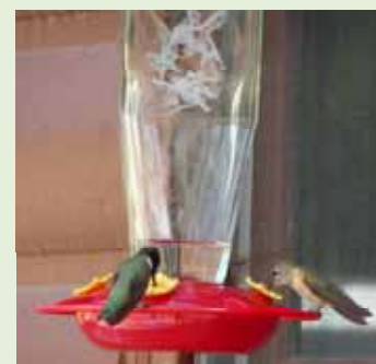
Anna's and Rufous Hummingbirds Drinking Together

It's not too late to join Project FeederWatch nor to gift a family member or friend with a membership. Project FeederWatch is a joint project of the Cornell Lab of Ornithology and Bird Studies Canada. Project FeederWatch is a winter-long (November-April) survey of birds that visit feeders at backyards, nature centers, community areas, and other locales in North America. Participants periodically count the birds they see at their feeders and send their counts to Project FeederWatch. Your bird counts help you keep track of what is