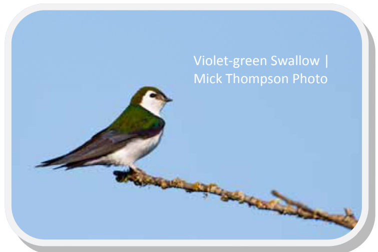
Violet-green Swallow