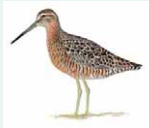
Long-billed Dowitcher | Audubon

Trip leaders: Wilma Bayes, 360-629-2028; Virginia Clark, 360-435-3750