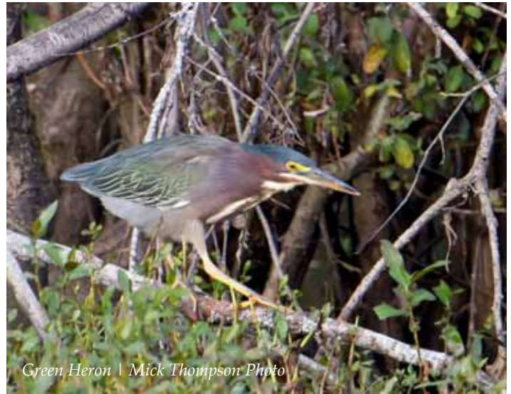
Green Heron