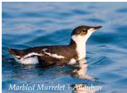
Marbled Murrelet | Audubon

The Department of Natural Resources (DNR) and the U.S. Fish & Wildlife Service (USFWS) is asking for your input on a revised set of conservation alternatives for