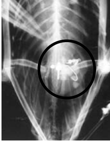
This x-ray of a dead loon shows lead weights and other fishing gear in its gizzard.

In addition, using flies containing lead was banned on Long Lake in Ferry County.