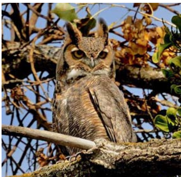
Great-horned Owl, by Donald Metzner

The kinglets are out also. Carole and Larry Beason reported 12 Golden-crowned Kinglets in their yard near Lake Bosworth. They also reported 38 Buffleheads on the lake, along with 15 Common Mergansers , 2 Hooded Mergansers , and a Great Blue Heron . They reported 2 Belted Kingfishers flying over, 3 Red-breasted Sapsuckers , 15 Red-winged Blackbirds , 2 Red-breasted Nuthatches , 6 Northern Flickers , 9 Spotted Towhees , 18 Steller's Jays and a Varied Thrush for a total species count of 37.