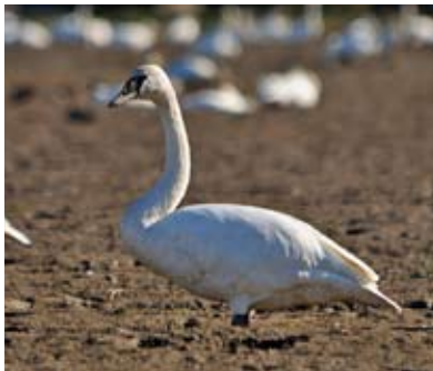
Trumpeter Swan, by Audy Loharungsikul

believe swans are likely reaching shallow underwater areas in fields and roosts where spent lead shot is still present.