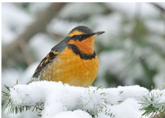
Varied Thrush, by Jim Martin

The first snow almost always brings the Varied Thrush back to my area. The day after our Thanksgiving week snow, I stopped for the mail along 100th in Marysville. The grass was covered with 2-3 inches of fresh snow. I spotted several robin-sized birds fly in and begin digging their beaks in the snow, tail feathers in the air. I finally realized they were Varied Thrushes . I counted 8 in all.